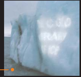
David Buckland, Ice Projection September 2004

'What struck me most on the expedition was the sense of isolation, an almost complete absence of people. The changes happening there are global indicators and a global responsibility. Maybe it's easier to live for today, but we have a responsibility to stop acting like there's no tomorrow.'